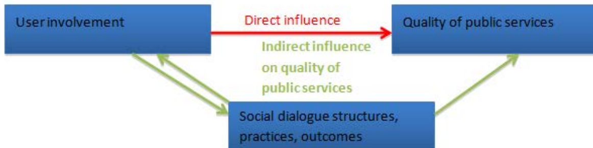
Figure 1 Analytical framework

social dialogue structures and practices serve as a procedural variable, which interacts with user involvement in its impact on the quality of services. Figure 1 shows the relationships studied in this report.