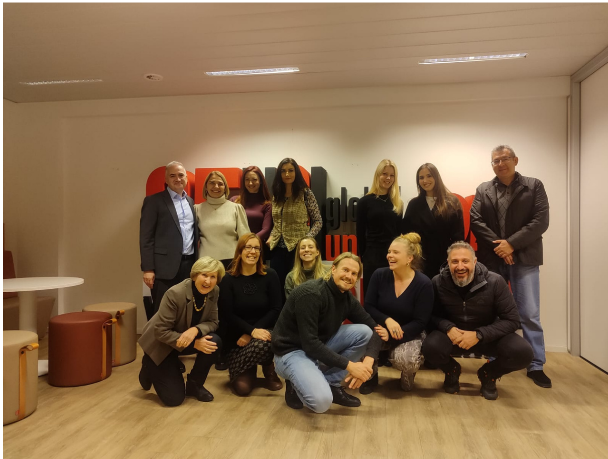
Picture: The BARSERVICE team at the UNI Europa office on 3 December 2025.

Not only did the day prove a good moment for many social partners to participate, discuss – in their own language, thanks to excellent interpretation – and exchange ideas and challenges, but the BARSERVICE team also enjoyed their time together, reflecting on next steps.