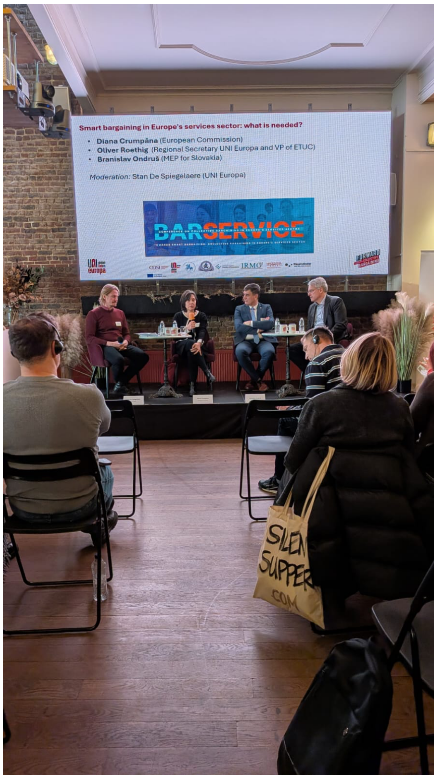
Picture: the panel with representatives from the European Parliament, the European Commission and UNI Europa to discuss the policy roadmaps.