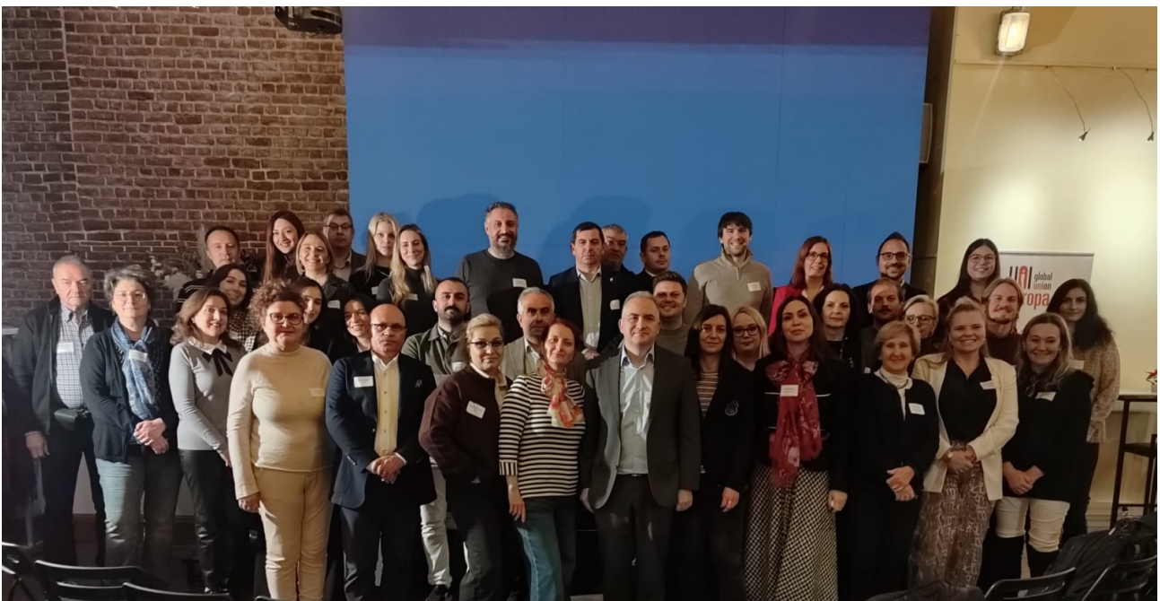
A picture of the participants during the Towards Smart Bargaining Conference, 4 December, Brussels

Collective bargaining must evolve and strengthen in response. Further research is needed into the role of different actors, supportive legislation, state intervention, and the content of collective agreements beyond wages. In the wider conversation about job quality in Europe, it is important to acknowledge the potential of collective bargaining to address issues such as health and safety, skill development, and work-life balance.